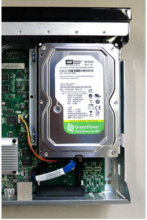
Figure 7 (above) Top View

Once the bracket and new drive are installed, attach the drive cables to the hard drive.