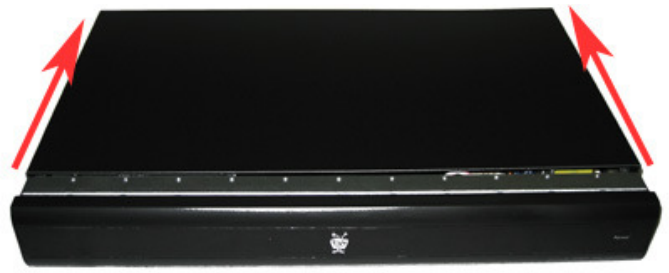
Figure 3 (above) Front View