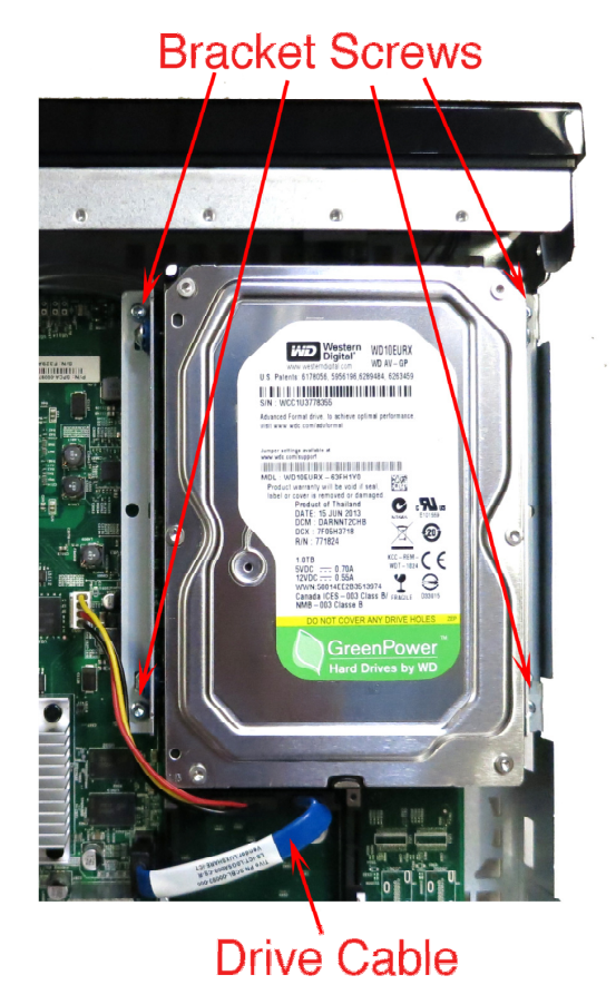
Figure 4 (above) Top View

Using your Torx T10 L-key, unscrew and remove the four bracket screws that connect the hard drive bracket to the TiVo. See Figure 4.